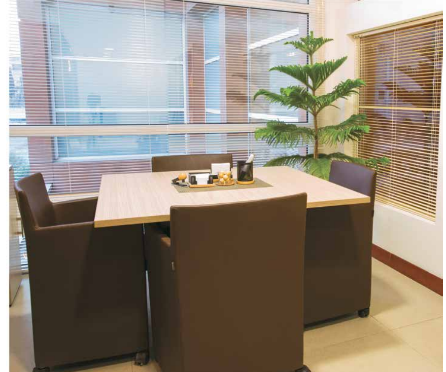
KING LABELS MANUFACTURE, DESIGN, PRINT -