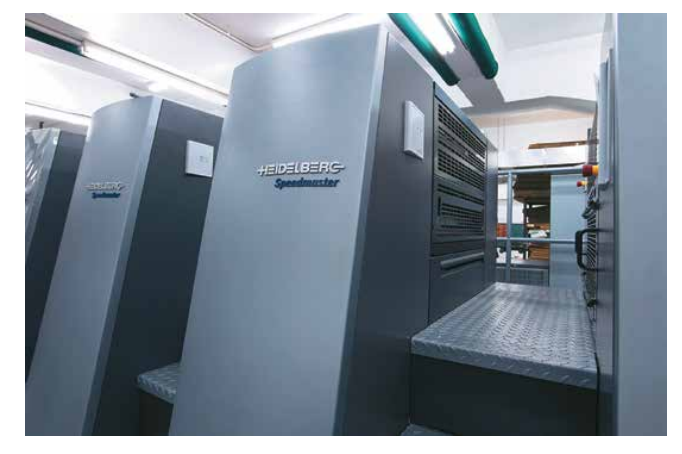
King Labels presents its products by using the most up to date technology of the world and by having 15 years of professional experience in the fields of printing and by using the most advanced offset printing apparatuses and additional services such as Lithography, bookbinding, inlay, cellophane treatment, die cut, letterpress, UV