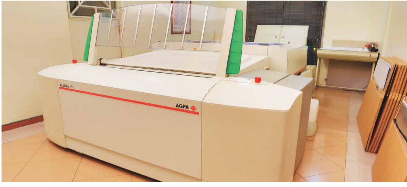
Lithography and Printing Department